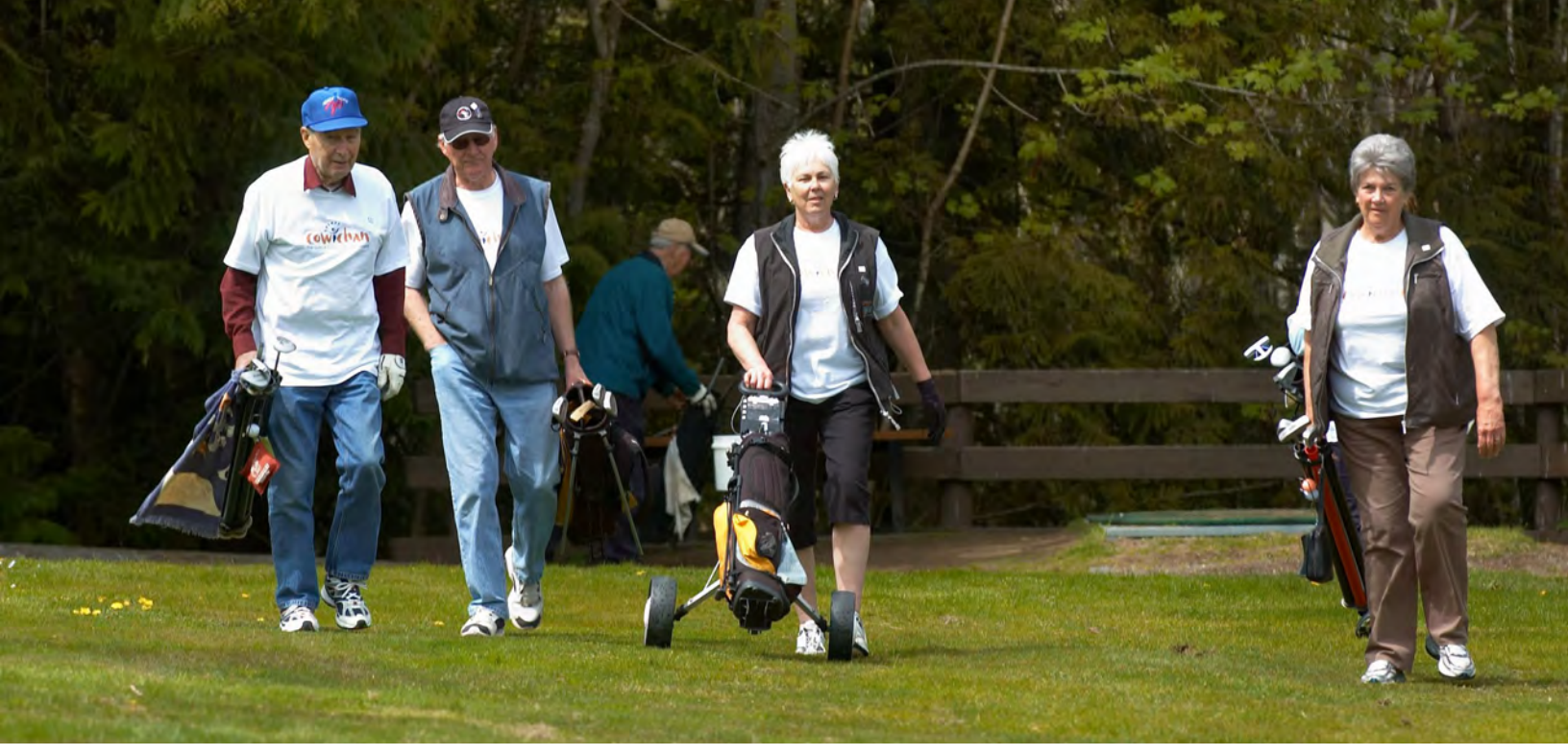
Ladysmith Golf Course

The following table outlines suggested indicators for use in monitoring Ladysmith's performance in promoting public health and social development.