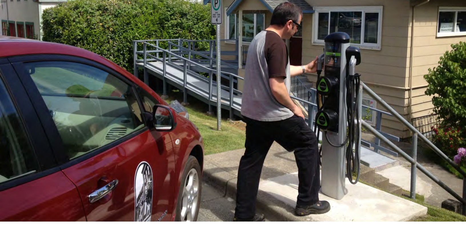
Town of Ladysmith vehicle being recharged at electric vehicle charging station on First Avenue

The following table outlines suggested indicators for use in monitoring Ladysmith's performance in sustainable energy use and reduced GHG emissions.