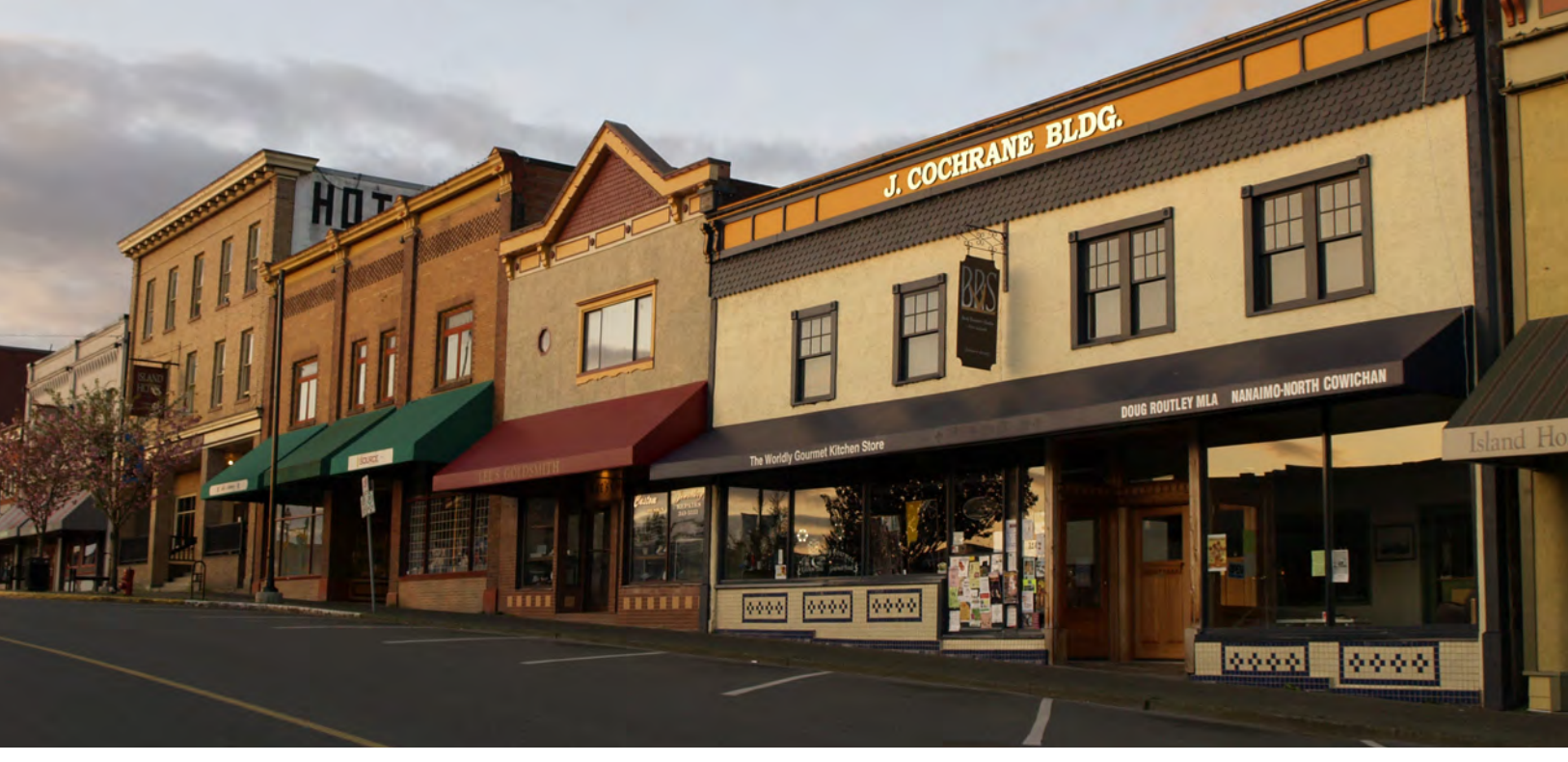
Ladysmith's walkable downtown

The following table outlines suggested indicators for use in monitoring Ladysmith's performance in the sustainable management of growth in development.