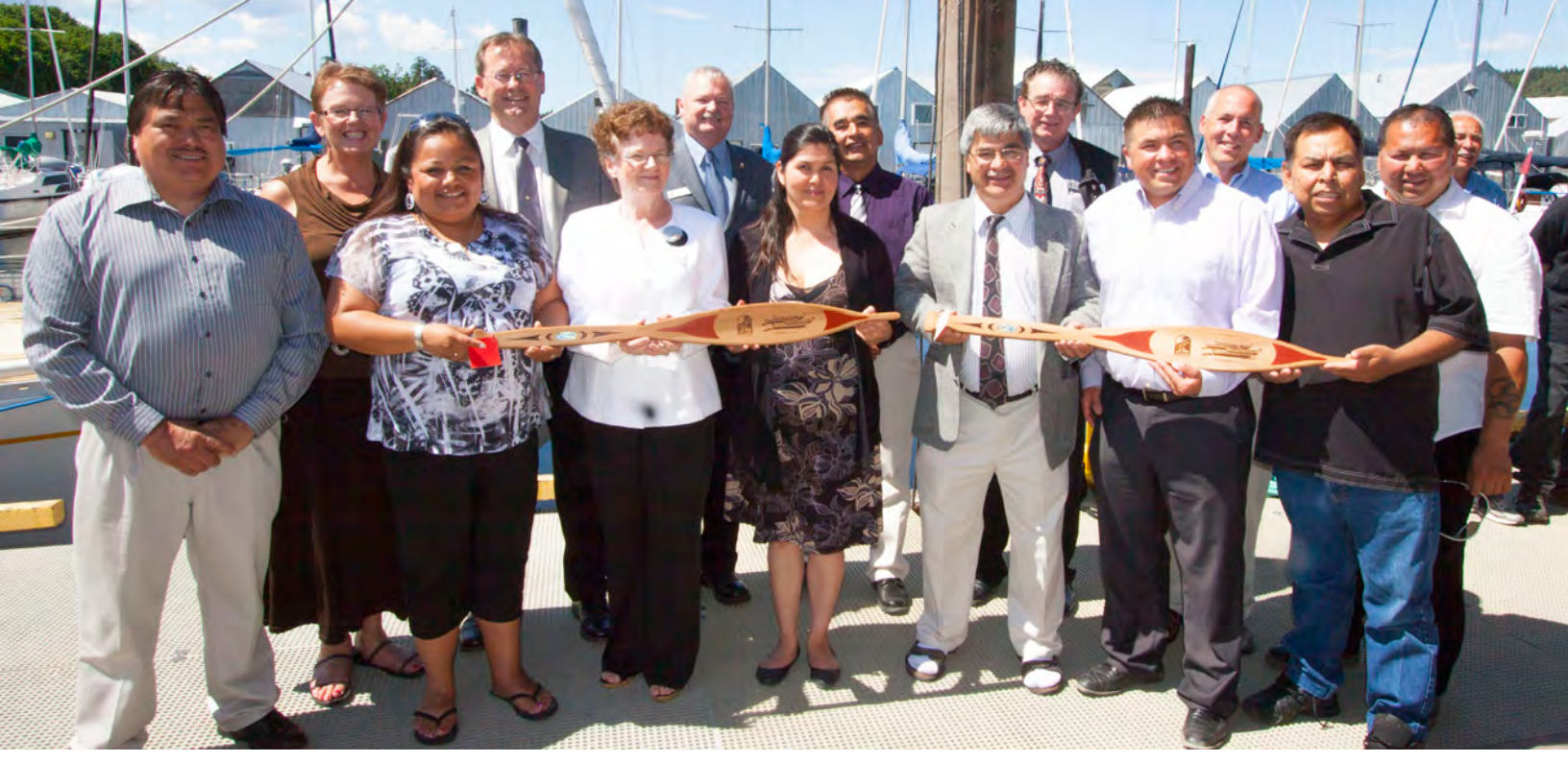
Town of Ladysmith and Stz'uminus First Nation signing Naut'sa mawt Community Accord

The following table outlines suggested indicators for use in monitoring Ladysmith's performance in encouraging efficient, effective and supportive governance.