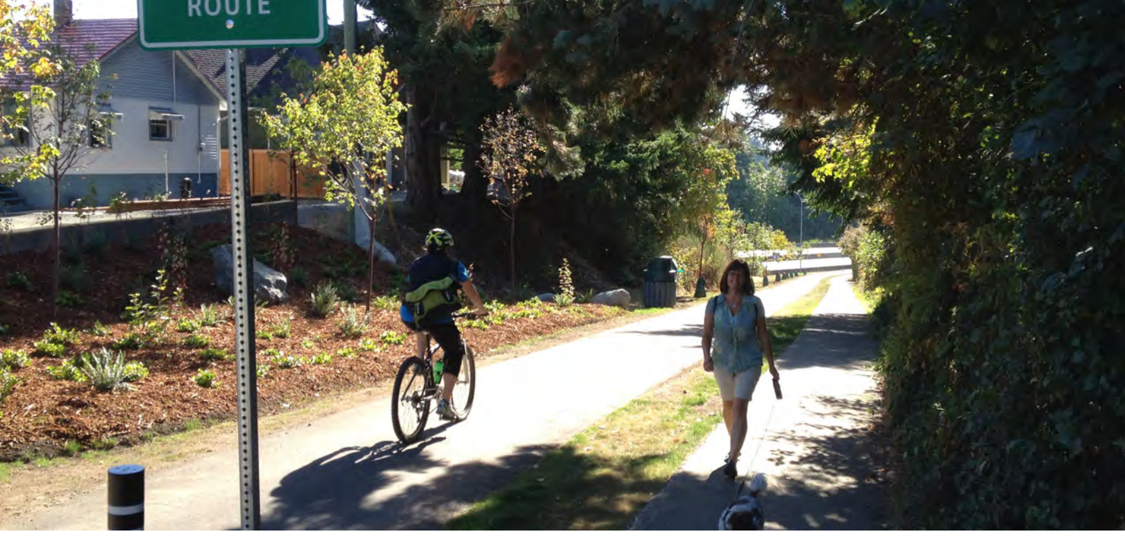
Multi-use Trail in Ladysmith

The following table outlines suggested indicators for use in monitoring Ladysmith's performance in encouraging sustainable mobility.