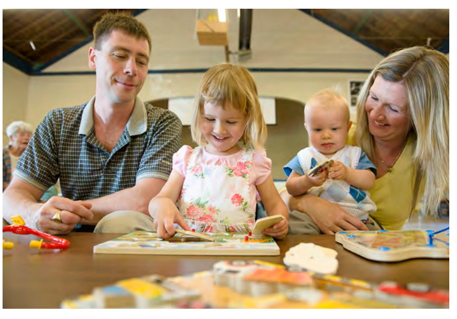
Ladysmith Family and Friends (LaFF) program at Aggie Hall