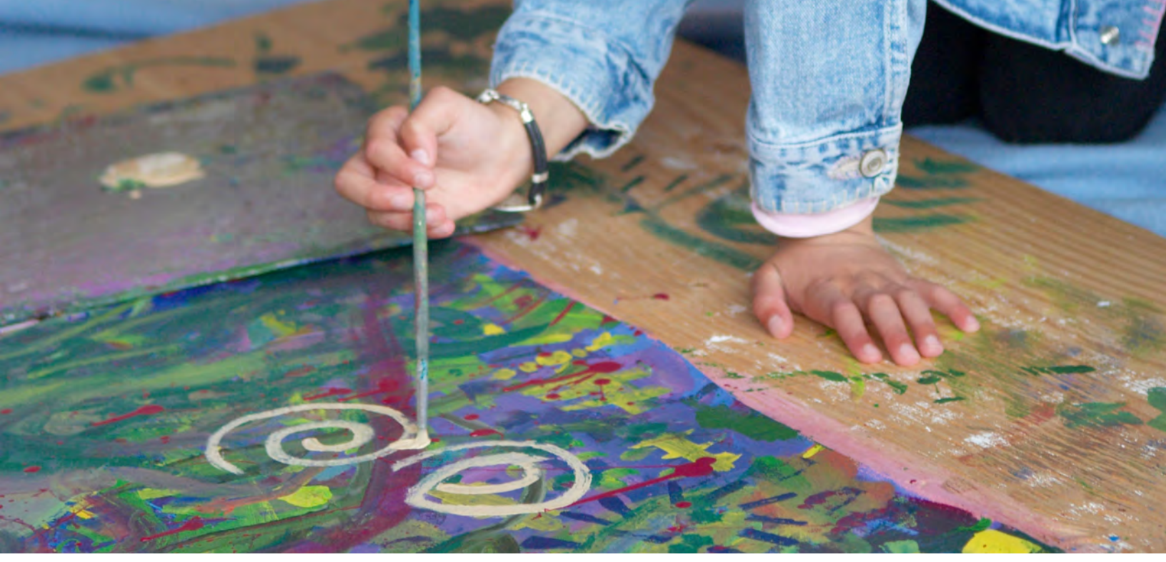
Town of Ladysmith arts programs

The following table outlines suggested indicators for use in monitoring Ladysmith's performance in the nurturing culture and identity.