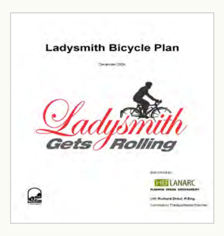
Ladysmith Bicycle Plan