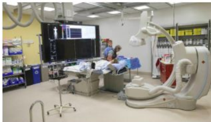
Part of the cardiac unit at Royal Jubilee Hospital.