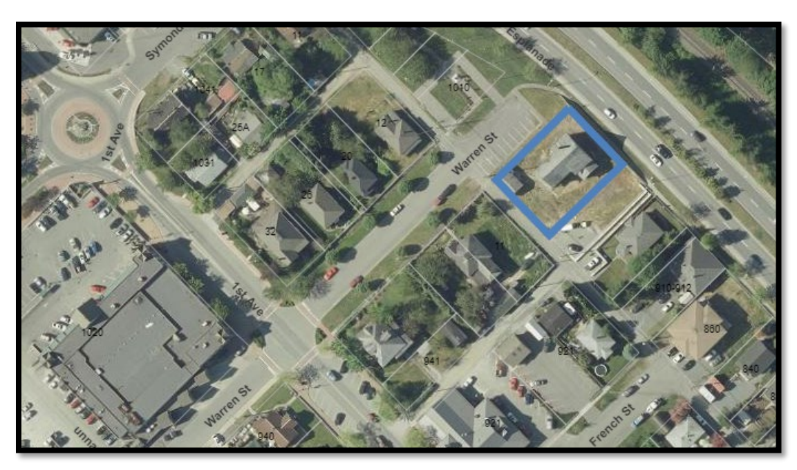
Figure 2: Subject Property - 940 Esplanade Avenue

The property is on a corner, with frontage on the Trans-Canada Highway and Warren Street. There is no direct access to the Highway. There is access via Warren Street and also a laneway running parallel to the Highway. Across Warren Street is the Rotary Memorial Peace Park and Cenotaph, a small park that contains a memorial to local soldiers killed in WWI and WWII. The property beside 940 Esplanade is vacant. The other properties in the surrounding area contain single family residential homes. The properties are zoned a mix of Downtown Commercial (C-2) and Live/Work Residential (R-2-LW).