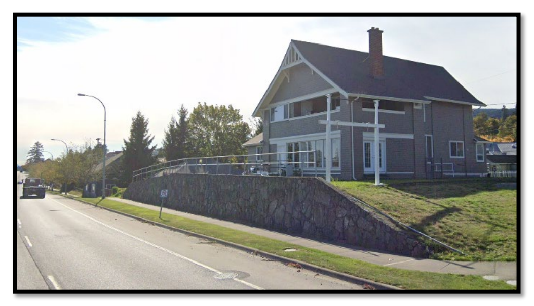
Figure 1: 940 Esplanade Avenue from the Highway

The property is approximately 1,010m<sup>2</sup> in total size and contains a 2-storey building with a residential appearance. According to the Ladysmith Historical Society, the 940 Esplanade building was constructed in 1907. The property is not listed on the Ladysmith Community Heritage Register.