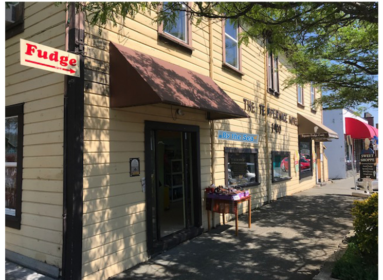
High Street: located above the first window