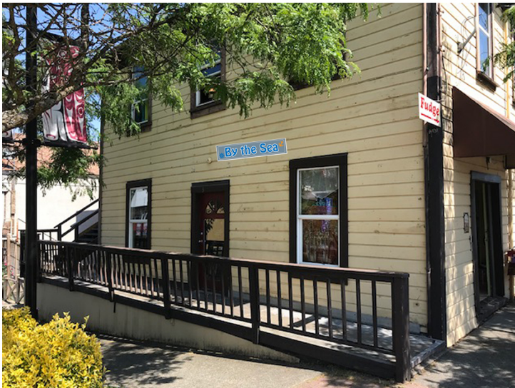
First Avenue: located between the door and window, above window height