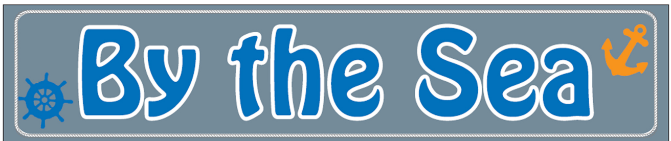
Material: Raised high density foam lettering on Alu-panel Dimensions: 1.5 ft by 4 ft