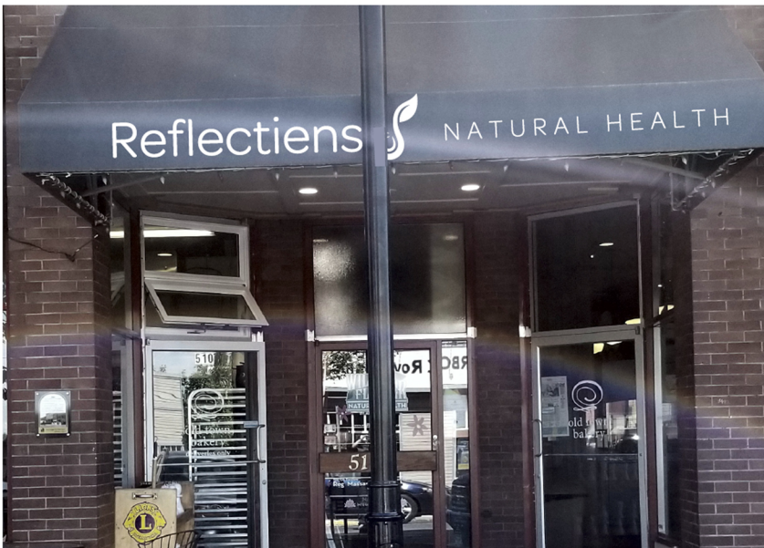
HRAC Review - Sign Permit Application "Reflectiens Natural Health" - 512 First Avenue