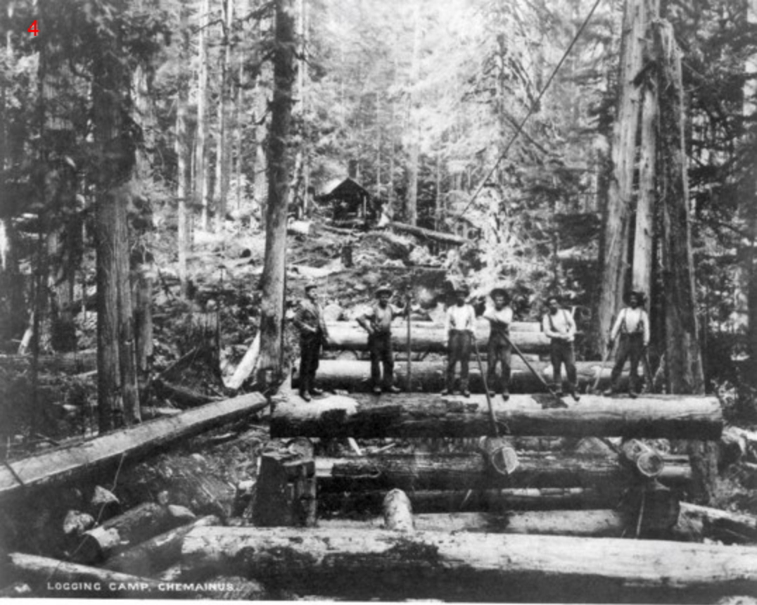
LOGGING CAMP, CHEMAINUS.