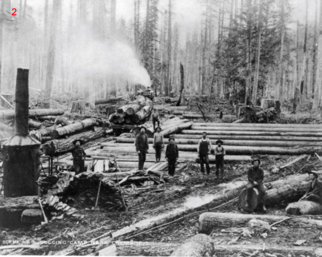
SCENE NEAR LOGGING CAMP NEAR CHEMAINUS