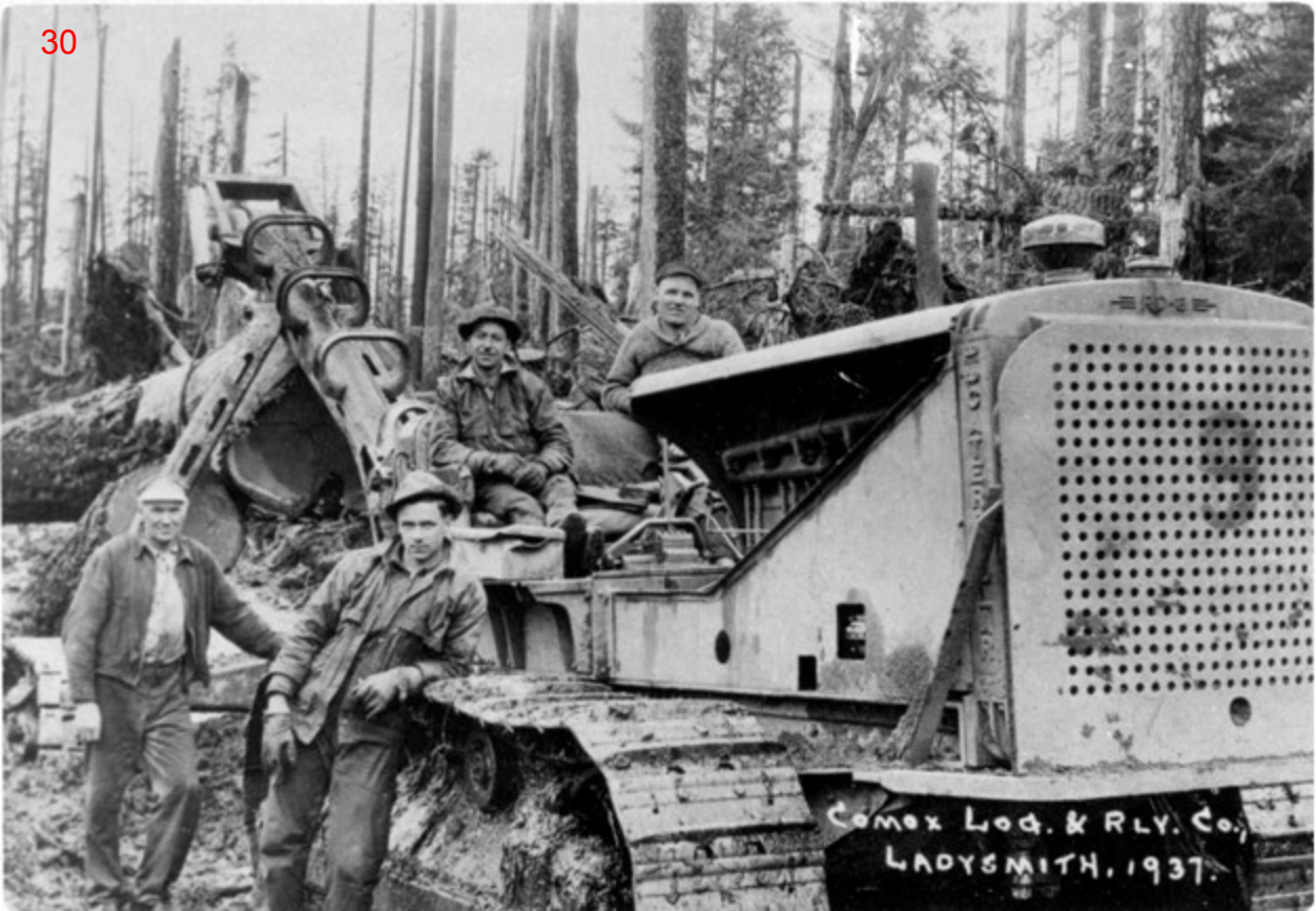
Comex Log. & RLY. Co. LAOYSMITH, 1937.