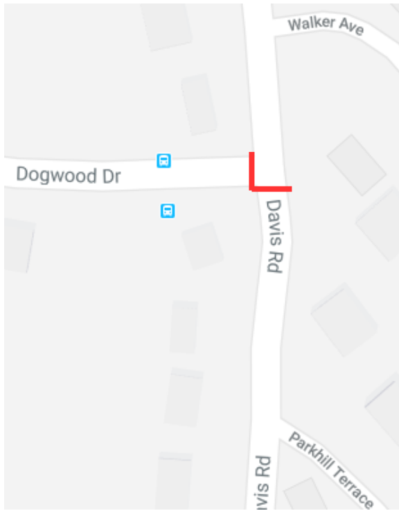
Davis Road at Dogwood Drive