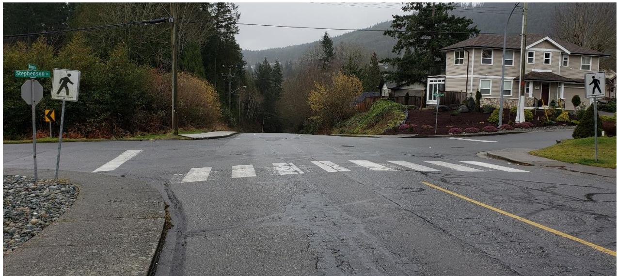
Looking south along Dogwood Drive at Stevenson Street