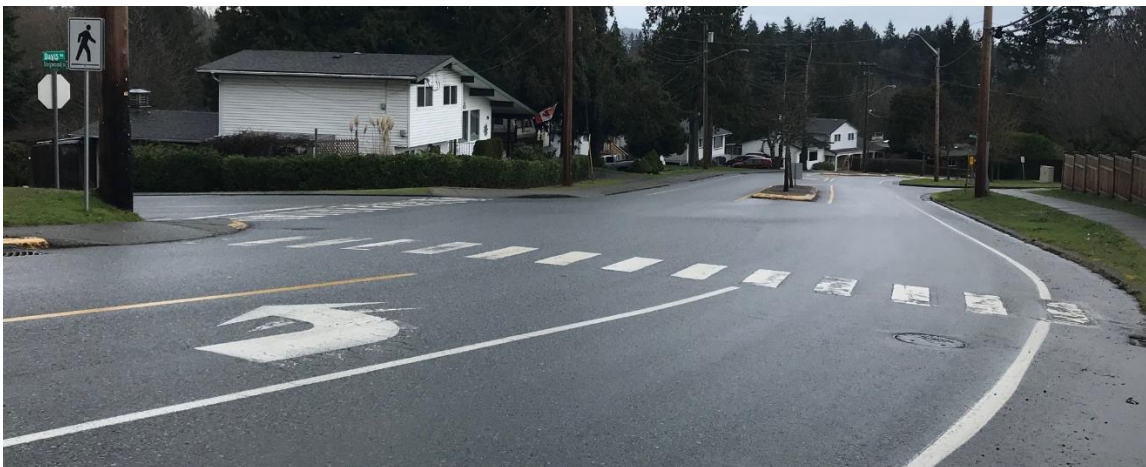
Davis Road facing north-east at Dogwood Drive