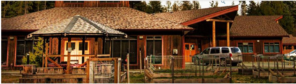
Stz'uminus Health Centre

Following each of the sessions, participants were invited to sign up to take part in upcoming neighbourhood audits, assist with doing outreach to local businesses and/or join a conversation to explore the option of redeveloping a Seniors Coalition.